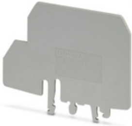
Separating plate, length: 103 mm, width: 2 mm, height: 70.1 mm, color: gray

Please be informed that the data shown in this PDF Document is generated from our Online Catalog. Please find the complete data in the user's documentation. Our General Terms of Use for Downloads are valid ( http://phoenixcontact.com/download )